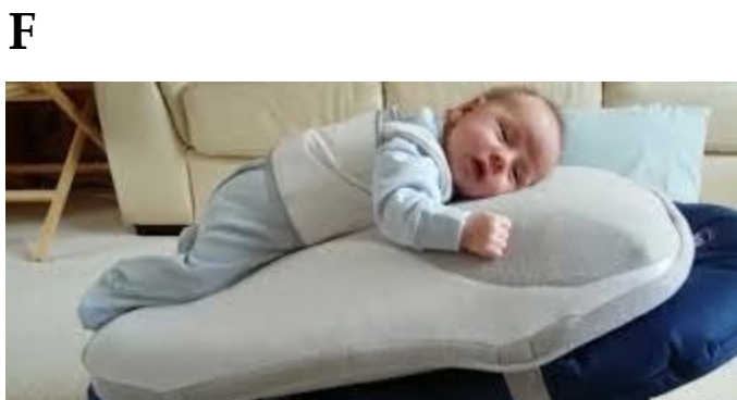
F Babocush ($179.99) NOT intended for sleeping, but what are the chances that a baby that has this does not spend time sleeping in it?