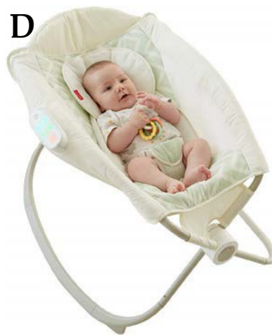
D Rock-N-Play ($40 and up) RECALLED in May 2019 after consumer reports identified 32 infants that died in this sleeper.