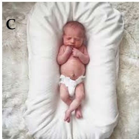
C Snuggle Me ($128-156) like a Doc-A-Tot but with a center "sling," allowing the sides to come in and "hug" the baby.