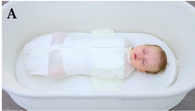
A SNOO Smart Sleeper ($1295 or rent for $3/day), created by Dr. Harvey Karp of Happiest Baby on the Block fame.