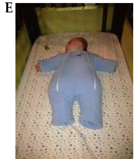
E Merlin Sleep Suit ($39.99) Intended for babies too big to be swaddled, theoretical concern for overheating, interference with normal development due to restricted movement