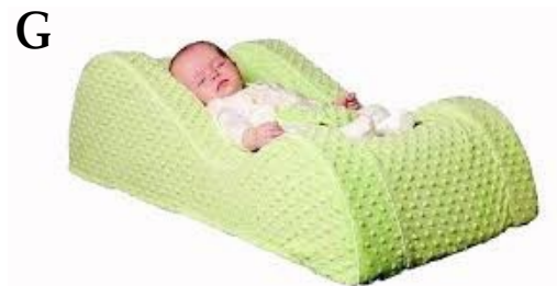
G Nap Nanny Infant Recliner -- RECALLED in 2014 after 6 infants died from suffocation in this device.

*****Review AAP policy statement for safe sleep and information about sleep products*****