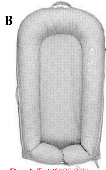
B Doc-A-Tot ($195-275), marketed as a baby lounger or co-sleeper.