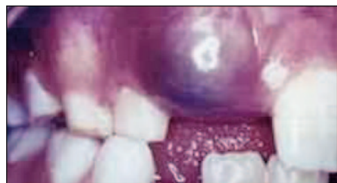
Figure 2. Eruption cyst.

Hippocrates claimed that children experiencing teething suffered from itching gums, fever, convulsions, and diarrhea, especially when cutting their eye teeth (canines). These beliefs were shared by many other philosophers of his time, and the belief that teething was a deadly disease was widely accepted until the late 19th century. Teething was known as “ dentition difficilis ,” Latin for pathologic dentition or difficult dentition.